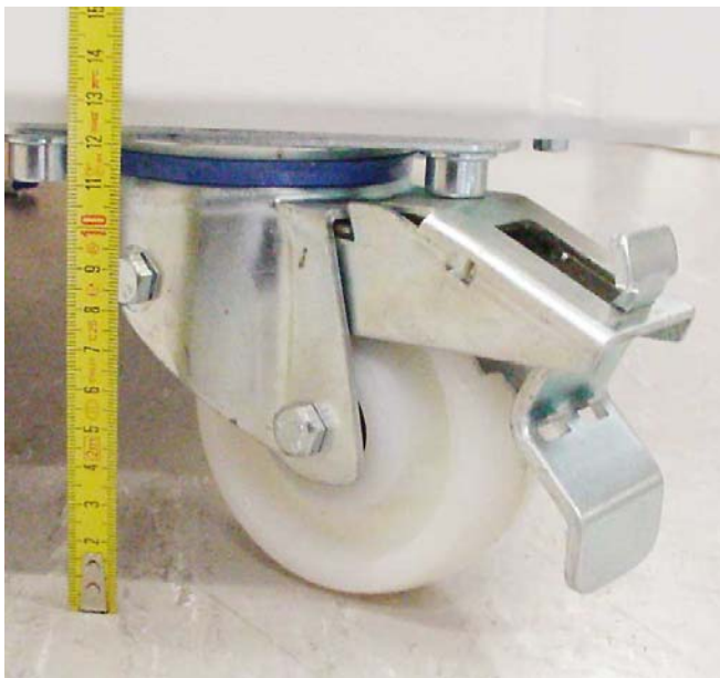
Old design with a height of 125 mm

We once used smaller casters but with them the Unit was nearly impossible to move. Currently we have two designs which are out in the field.